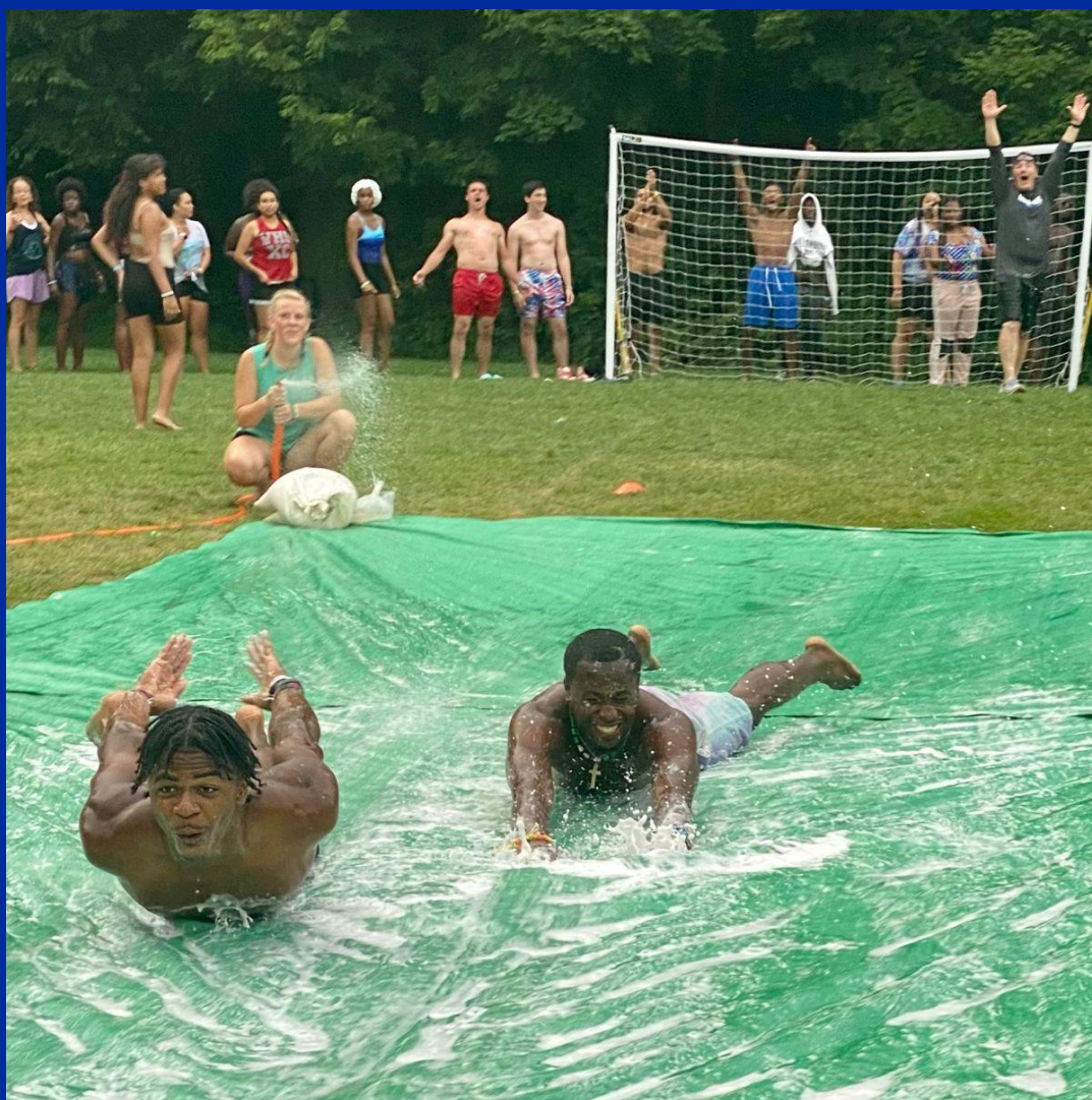
There's not a kid in America who doesn't smile ear to ear when sliding down a Super Slip N' Slide!

Thank you for all of your PRAYERS and SUPPORT for our summer staff team and the young people that we had the opportunity to love, serve, and introduce to Jesus this summer.