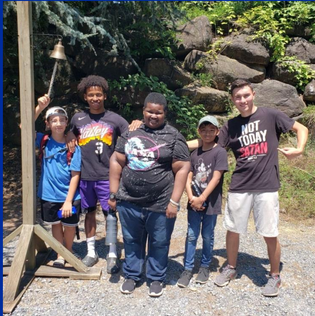
This group of boys made their way to the ISC "Born Again" Bell on Wednesday right before lunchtime. The t-shirt of the counselor on the right says it all - "NOT TODAY SATAN."

Our Term Four campers arrive today! Thank you in advance for all of your PRAYERS and SUPPORT for our summer staff team and the young people that we get to love, serve, and introduce to Jesus during this last week.