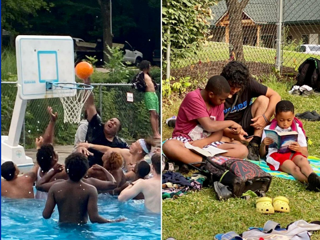
These two pictures are taken at the same pool at the same time. Both show counselors connecting in different ways and both scenes are awesome on so many levels!